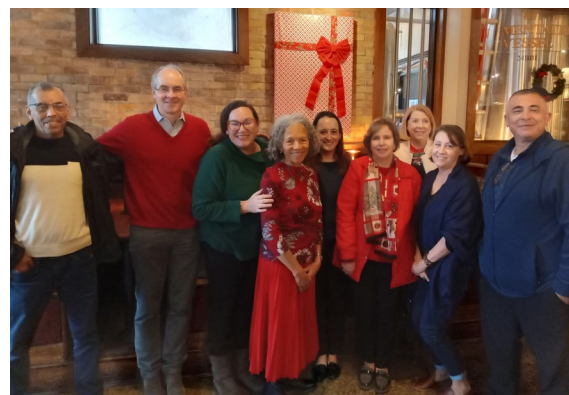
Staff Christmas lunch, December 10, 2024