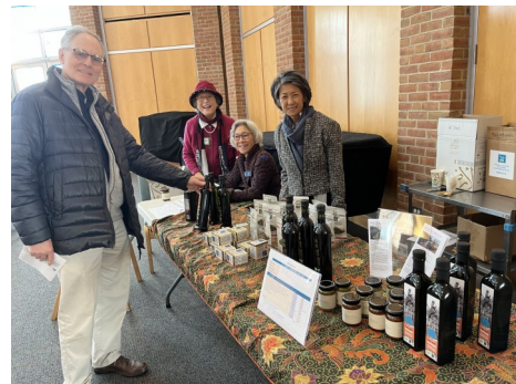
Olive oil sales during Advent.