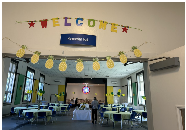
Set up and decorations for the Welcome Back Brunch on September 8, 2024.