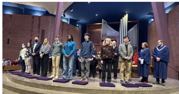
Installation of officers on January 26, 2025.