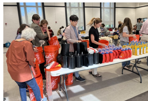
Assembling disaster kits on the Day of Service.