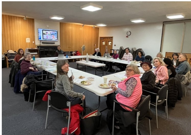
70th Anniversary Dinner planning meeting with dinner, January 14, 2025.

Please help us make 2025 a year to remember. Make sure to follow us for more updates on the Bradley Hills website at www.BradleyHillsChurch.org/70th .