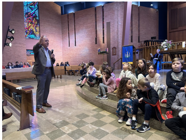
Third grade Bible presentation on December 10, 2024.

We are deeply grateful to the many BHPC members who supported this ministry throughout the year. We thank all of the church school teachers, milestone workshop instructors, second adults, and church youth who helped out during our events.