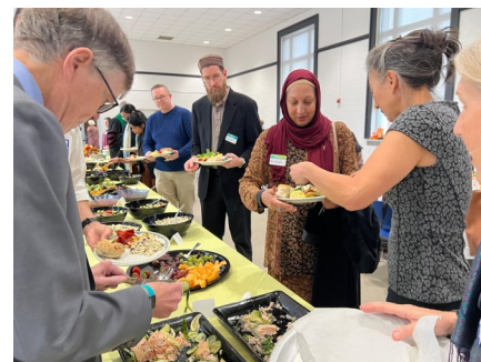
Enjoying a delicious meal together for Interfaith Brunch on November 17, 2024.