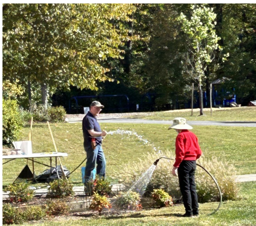
Watering during Fall Call, October 20, 2024.