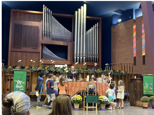
World Communion Sunday, October 6, 2024.