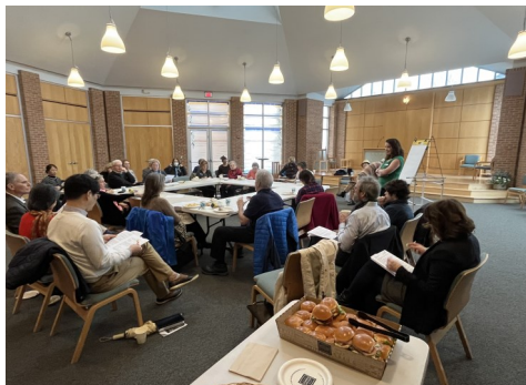
January 28, 2024, mission forum.

Bradley Hills is home to multiple mission projects and initiatives with diverse features designed to reach out beyond our walls. Some have independent sourcing; some are funded by the church budget. Members enjoy this variety of commitments and are called to participate in all kinds of engagement in the world, whether local or global.