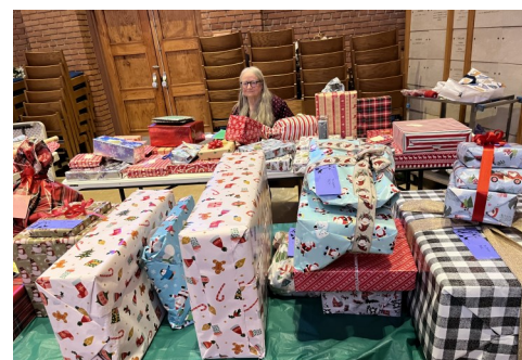
A pile of presents for Angel Gift Tree.