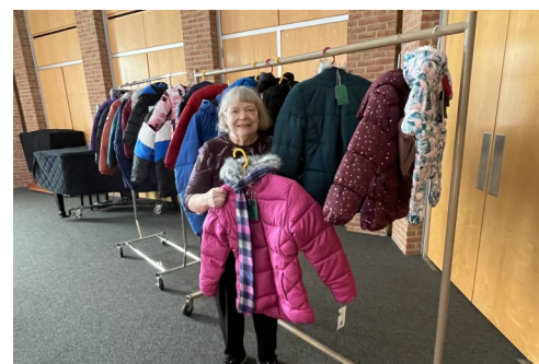
Organizing coats for the annual coat drive.