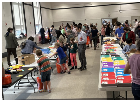
Day of Service, October 6, 2024.