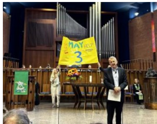
Chancel Players announcing 70th Anniversary Gala to take place on May 3, 2025.