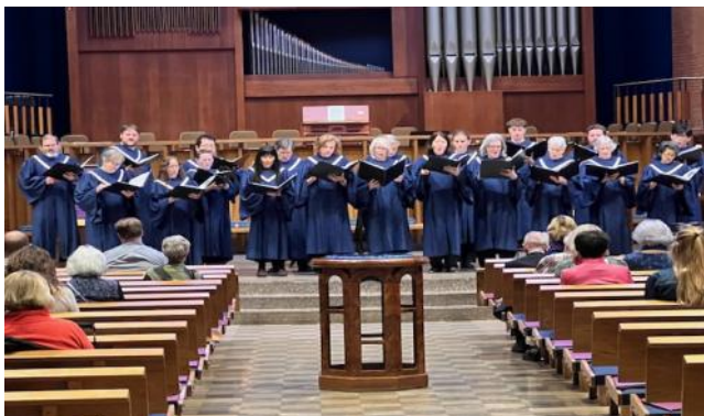
The Chancel Choir on Special Music Sunday, March 8.