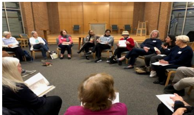
ICPC book discussion on March 25.